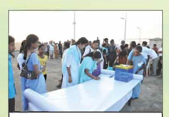
Signature campaign in progress