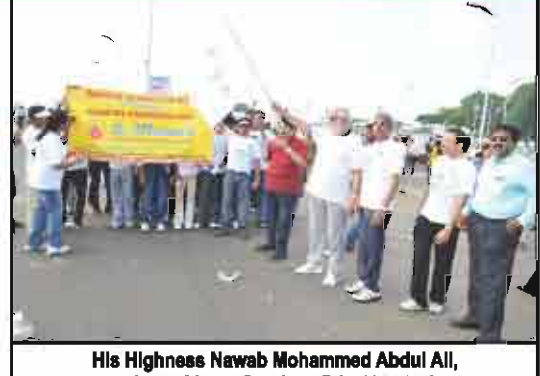
Prince of Arcot, flagging off the 'Jogging'

General of Police TN, flagging off the Walk