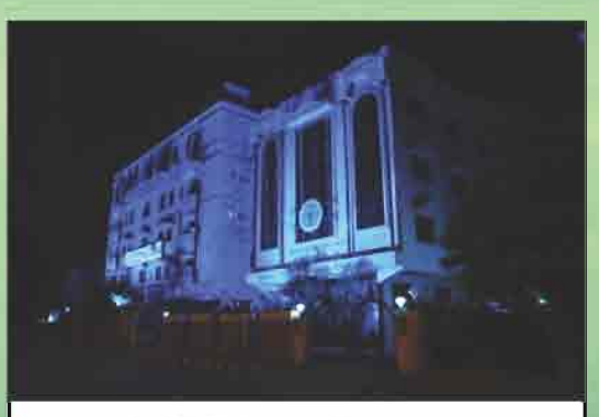
DMDSC, Goplalapuram lit in blue colour